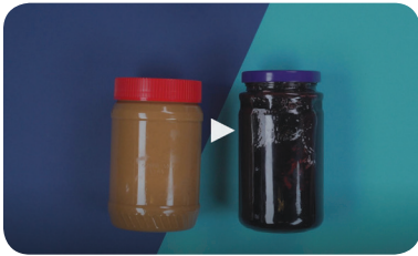
1 - Implicit Bias: Peanut Butter, Jelly, and Racism

Get started here: https://bit.ly/ImplicitBiasVideos