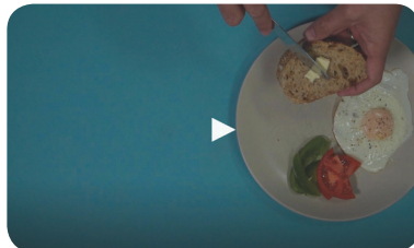
4 - Implicit Bias: Snacks and Punishment